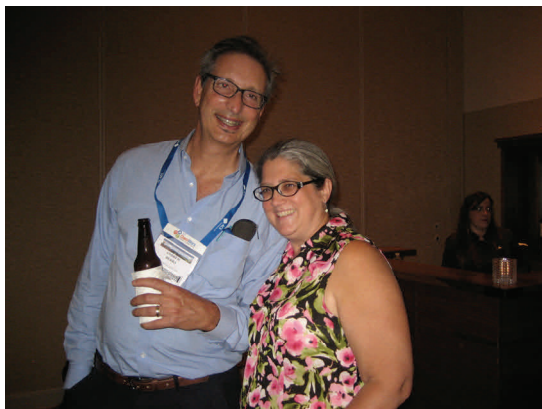
Photo Album from the ACS Fall National Meeting 2013 in Indianapolis